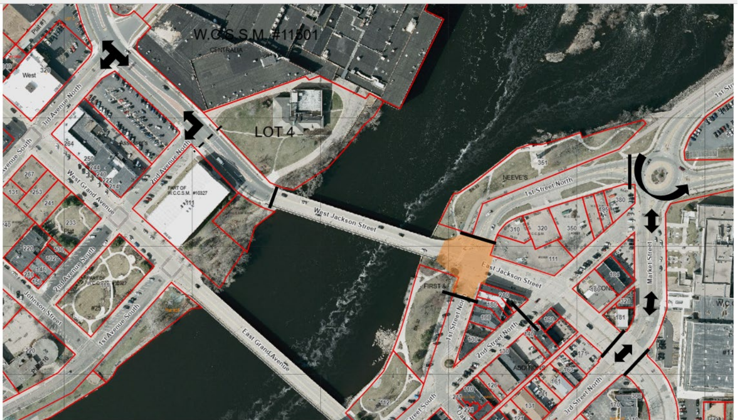
PHASE II - B

Once things are set up and ready in Phase II-A, the 1 st St N and E Jackson St intersection will be closed in Phase II-B, which will also impact traffic across the bridge for approximately two weeks while utilities are replaced within the intersection. Once complete, temporary pavement will be reinstalled, and the 1 st St N and E Jackson St intersection will be reopened.