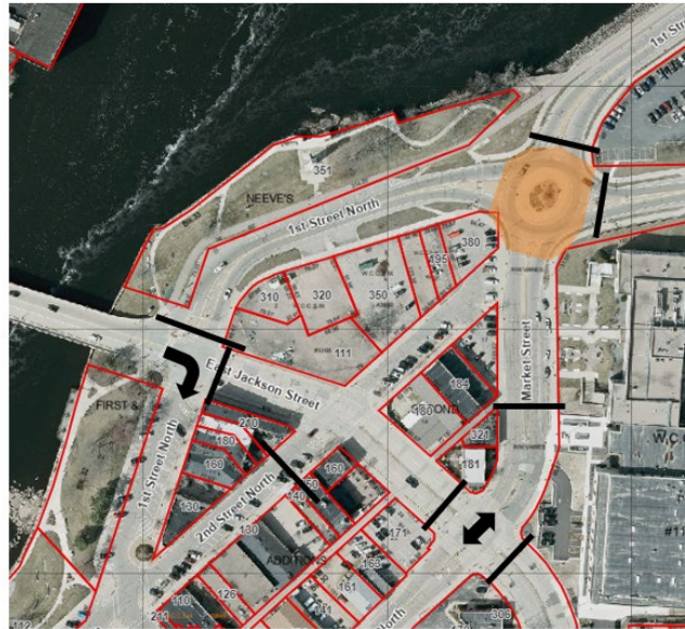
PHASE II - C

Following Phase II-B, work will be focused on E Jackson St between 2 nd St and 3 rd St in Phase II-C, including extending utilities north on 2 nd St toward the Baker St roundabout. Utilities will then be placed within the Baker St roundabout requiring the roundabout to be closed for approximately 2 weeks.