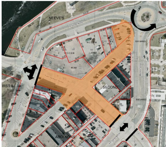
PHASE II - A

Once things are set up and ready in Phase II-A, the 1 st St N and E Jackson St intersection will be closed in Phase II-B, which will also impact traffic across the bridge for approximately two weeks while utilities are replaced within the intersection. Once complete, temporary pavement will be reinstalled, and the 1 st St N and E Jackson St intersection will be reopened.