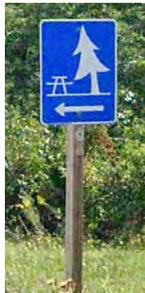
Sample highway wayside sign