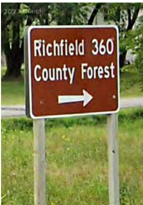
Sample highway directional sign