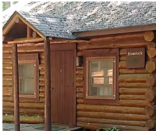
Sample lodge sign ( Hemlock ).