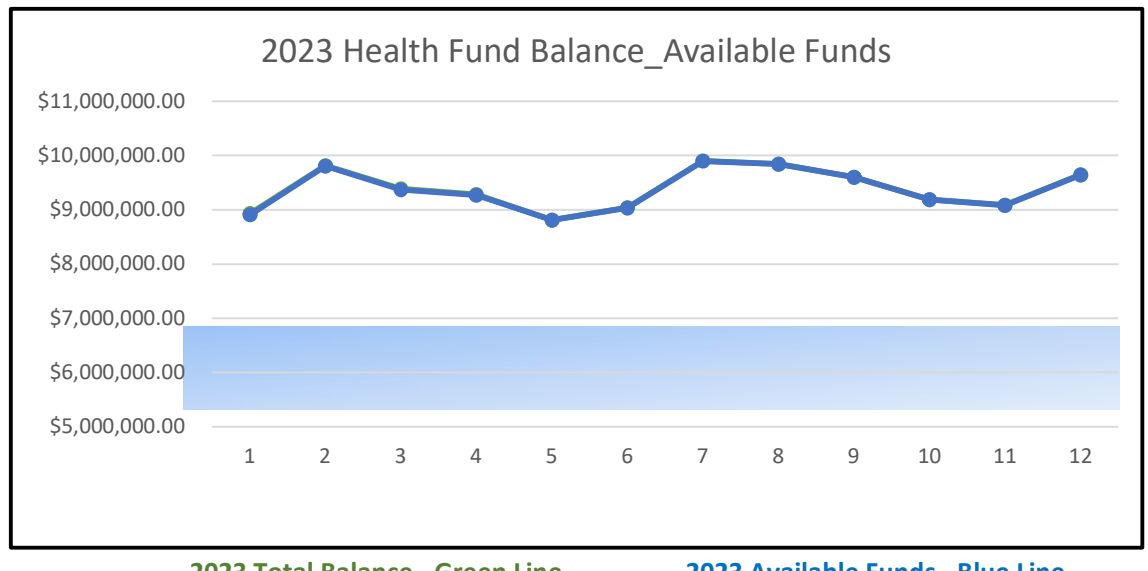
2023 Total Balance - Green Line