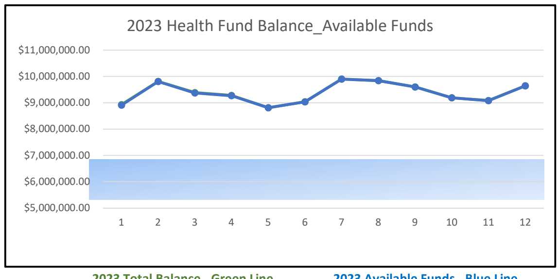
2023 Total Balance - Green Line